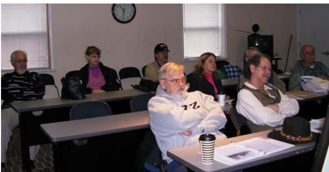
Turnout for the class was fair, but they look like a tough group.