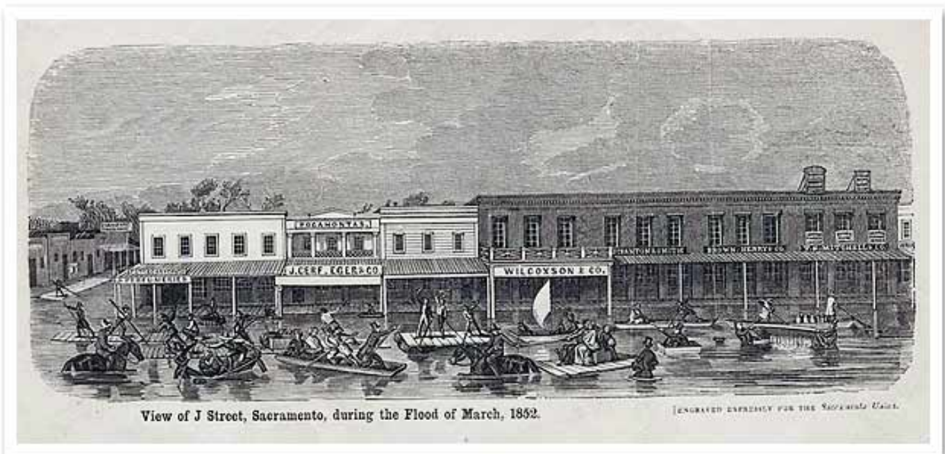
View of J Street, Sacramento, during the Flood of March, 1852.

The raised buildings that still exist are: Firehouse, Lady Adams, National Hotel, What Cheer, Ebners, Morse Building, Tehama Block (the brick building that replaced the wooden one that was rebuilt for Old Sac), Dingley Mill, US Hotel, Bennet's Masonic Hall, Brannan/Vernon House, Pioneer Bakery, B.F. Hastings, Mechanics' Exchange, Sazerac, Schroth, Booth & Co., Baker & Hamilton, Heywood's, Bank Exchange, Pacific Stables, Hotel de France, Union Hotel, Orleans. Other buildings, now gone, were also raised.